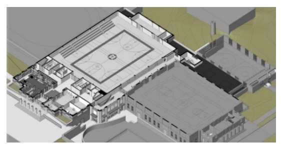
FIGURE 2: New Addition Entry Level Rendering

The new Centennial Gynmnasium addition will fill a void between the existing gymnasium and the Flippin' Field House (indoor track facility). The new facility will mirror the exterior appearance of the existing Centennial Gymnasium. A new auxillary gym with two full length basketball courts will be