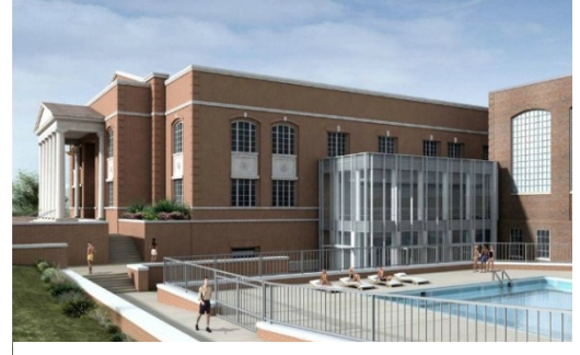
FIGURE 5: Rendering of New Centennial Exterior

The main building enclosure system for the exterior wall of the new Centennial Gymnasium, shown in Figure 5, is a modular "Delmarva" face brick backed by structural reinforced masonry bearing walls with